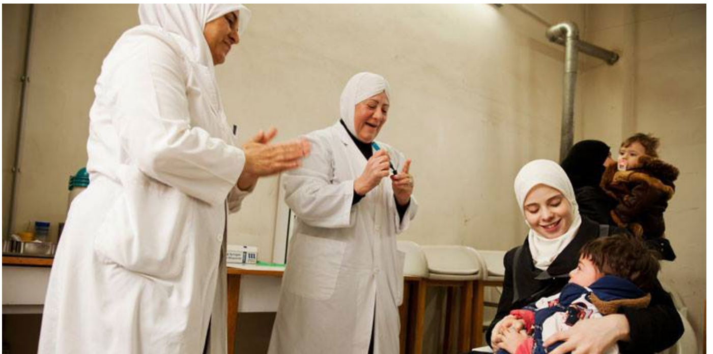
Of 23 UNRWA health centers in Syria, 13 were forced to close their doors due to ongoing violence.

To make up for the loss, UNRWA has opened eight health points in collective centers, where refugees can access free primary and mother-and-child health care--like this child, receiving a vaccination.