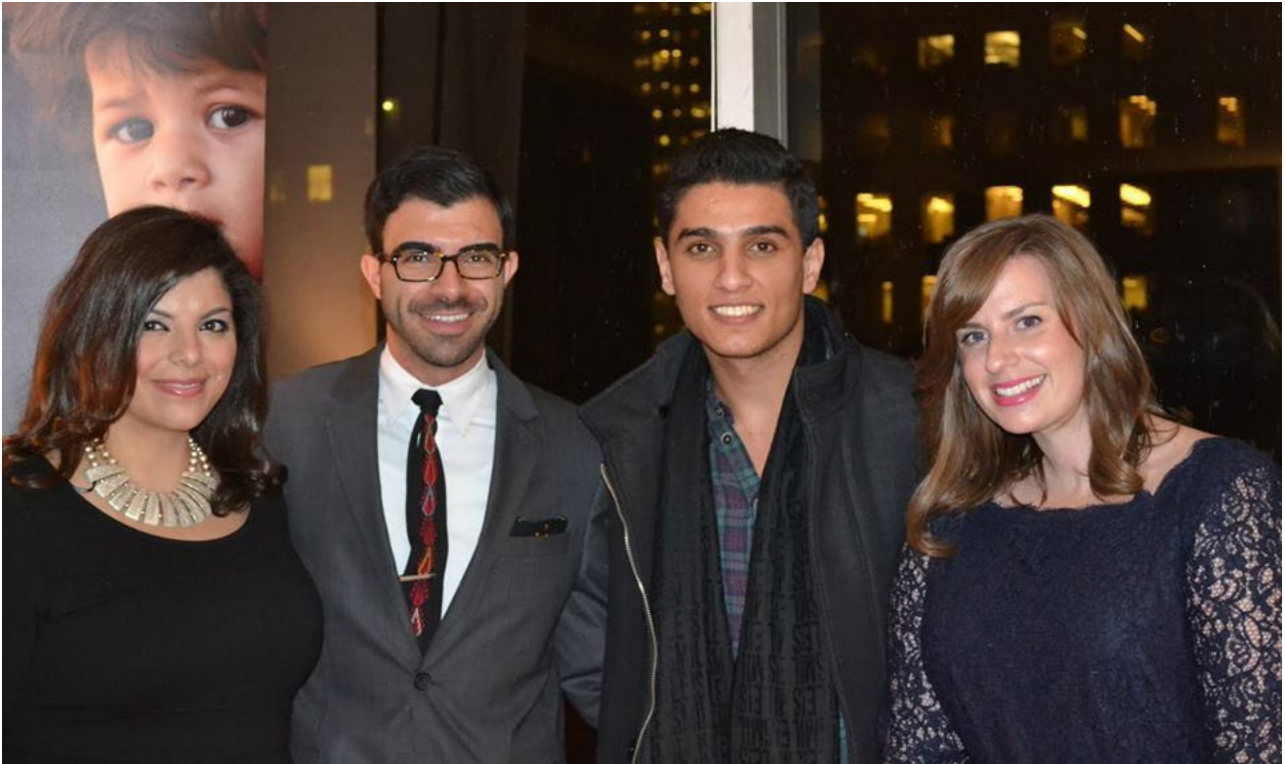
Mohammed Assaf, poses with the American Friends of UNRWA staff, New York, November 2013.