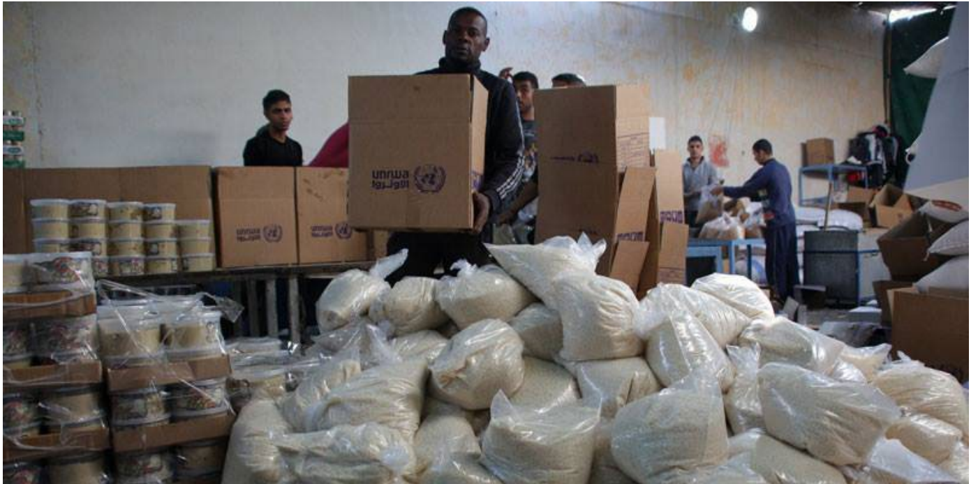
UNRWA continues food aid to Palestine refugees affected by conflict in Syria.