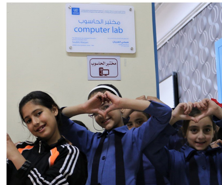
The brand new computer lab in Al-Jofeh Elementary Girls & Boys School in South Amman, Jordan